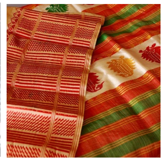
Day 1- Fri Feb 2