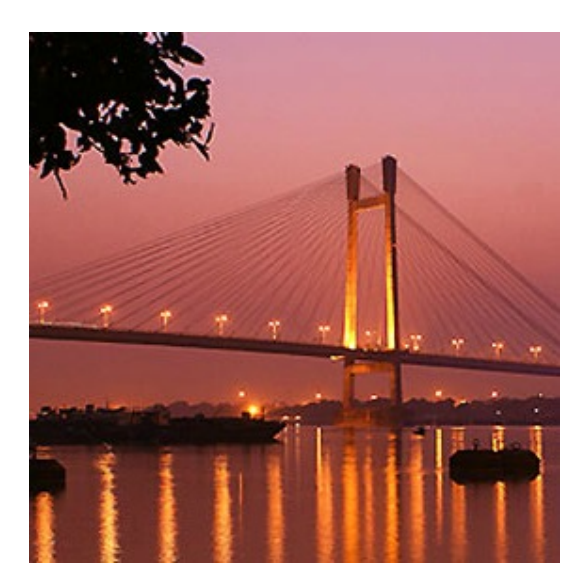
Day 4 – Mon Feb 5